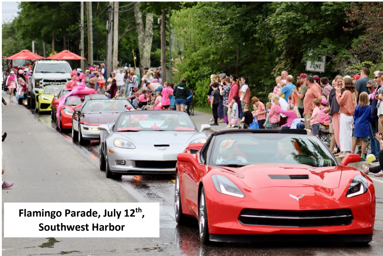
Flamingo Parade, July 12 th , Southwest Harbor