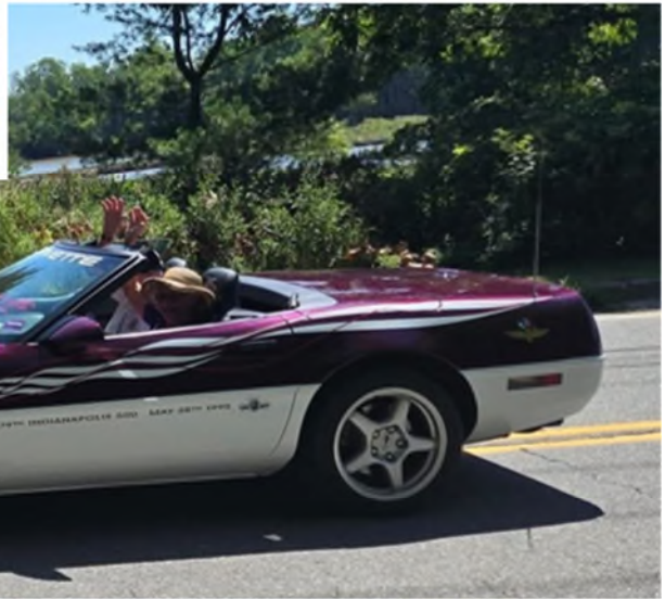
Millbridge Days Parade, July 26 th