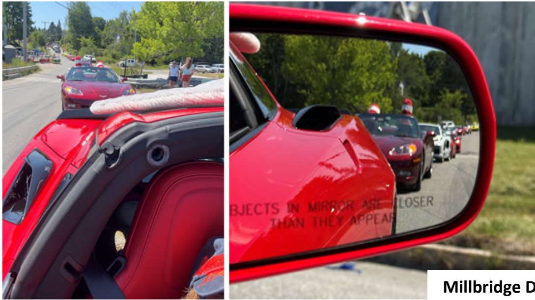
Millbridge Days Parade, July 26 th