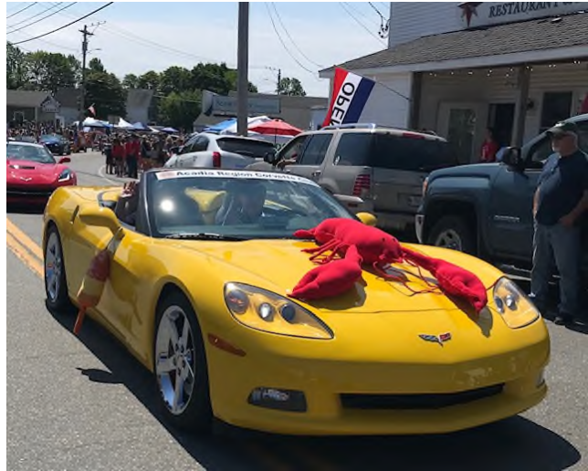
(If you didn't guess from the photos above, the parade theme was "Lobstahs.")